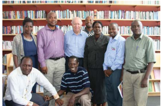
2009 Watson Scholars of the Environment with Ricardo Lagos, UN Special Envoy on Climate Change and a Brown professor at large

Such site visits will advance a comparative approach to environmental change, enabling scholars to learn from the successes and failures of US