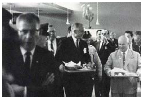
Nikita Khrushchev and Thomas J. Watson Jr. in an IBM cafeteria